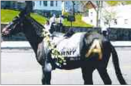
Ranger II, the current mascot mule.