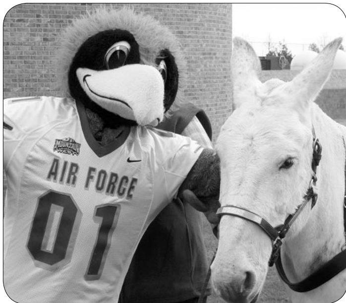
The Air Force Academy "Mascot" and "Flash"

think he was enjoying himself as much as all of the people at the pep rally. We both enjoyed ourselves and not only was it a very good pep rally, it was a successful fund raiser for a worthwhile charity. I would recommend to anyone that has a very calm, gentle mule and has the opportunity to participate in an event similar to this, they should do so. These type of situations are extremely good exposure for mules and for a lot of people it will be the first time they have ever actually seen a mule except for TV and have a total misconception as to what mules are actually like.