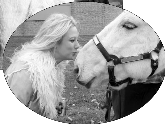
A few shots of the kissers