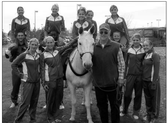
The Air Force cheerleaders having their picture taken with “Flash”