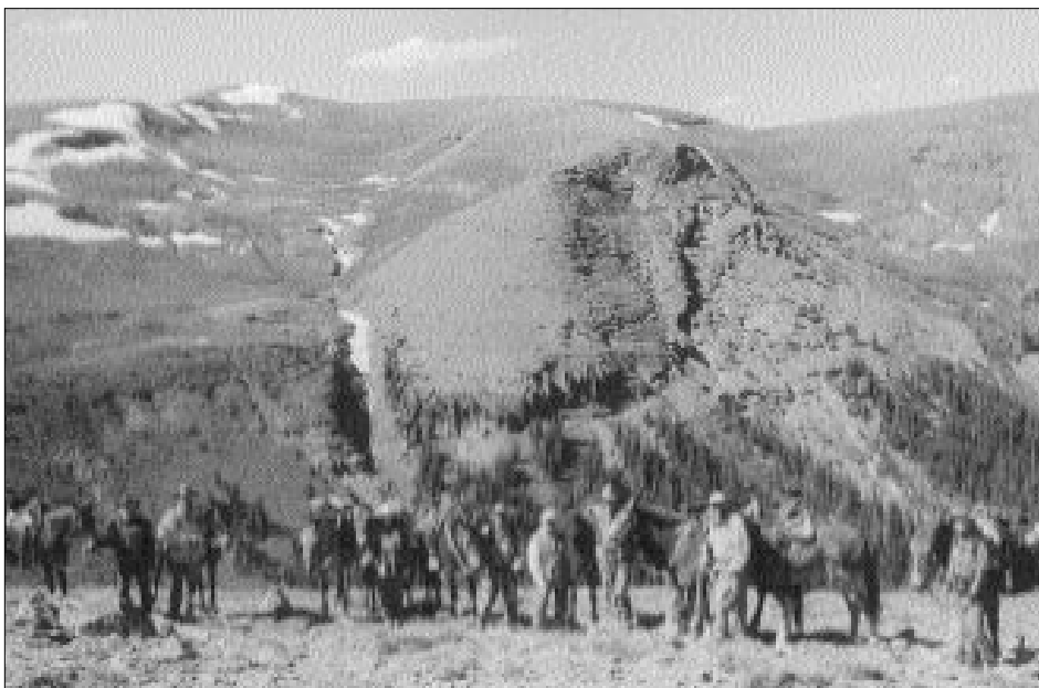
A group photo taken in one of those special places