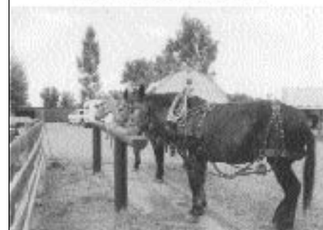
"Joshua" in harness waiting to be hooked to a walking plow. "Jake", in the middle, waiting patiently for more instruction. "Tote" on the far end is very much awake, for all this is new stuff to him.