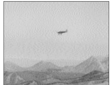
I'd sneak a photo from time to time, this is one of them